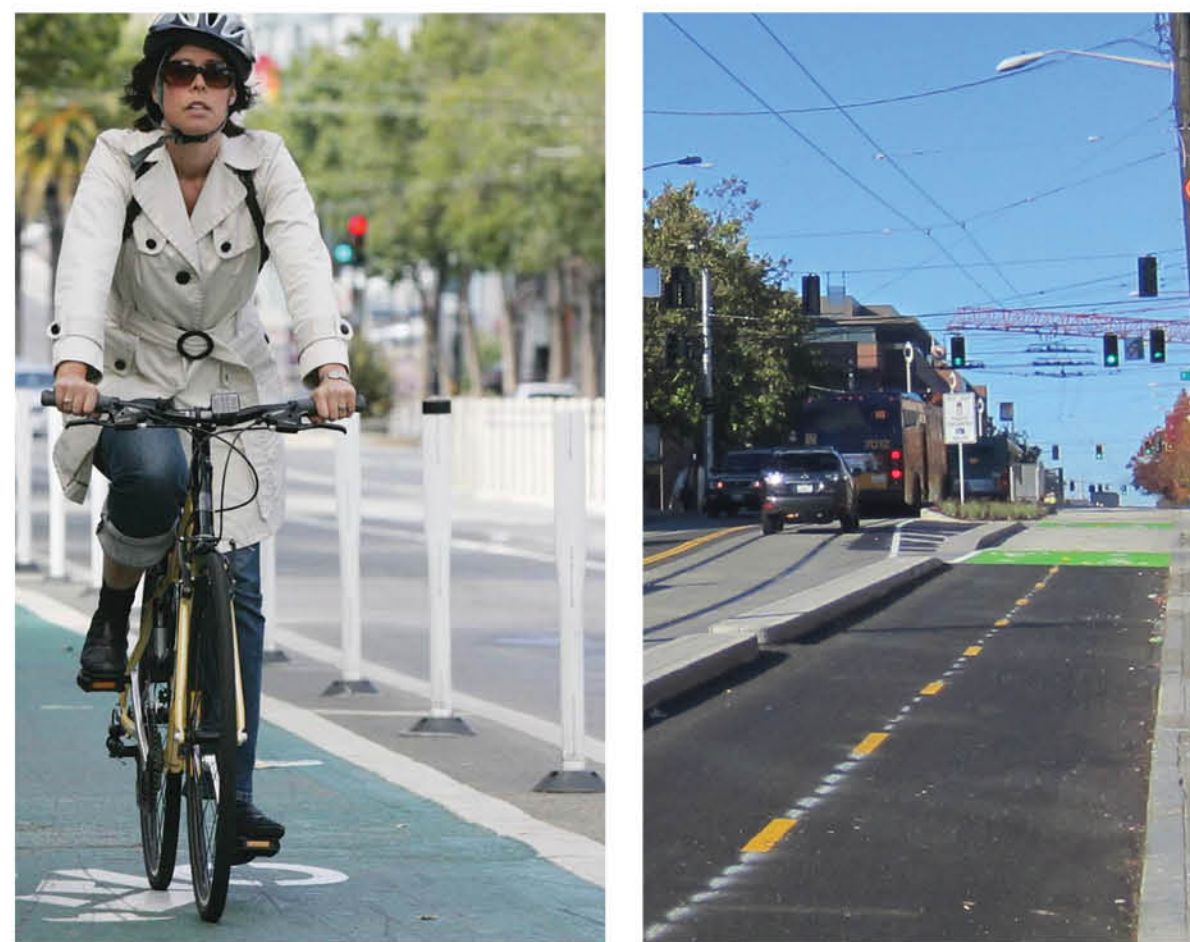
2 Separators - Delineator Post (Left) or Concrete Curb (Right)