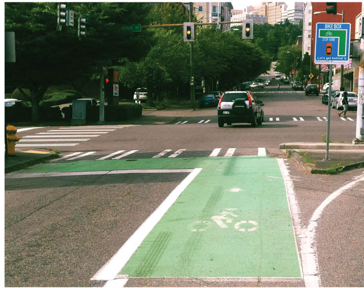
1 Bike Box