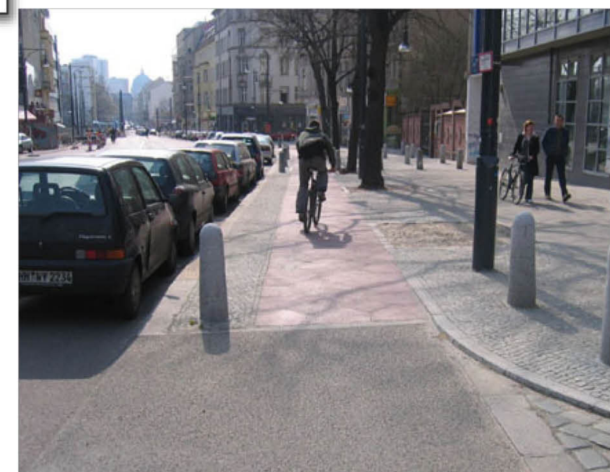
6 Bike Transition to Sidewalk