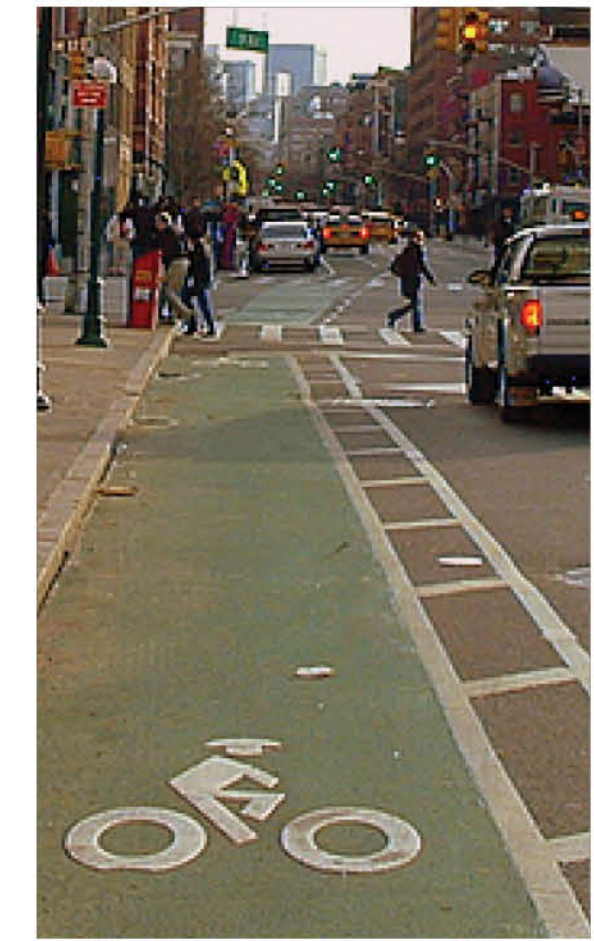
4 Left Bike Lane/Turn Lane