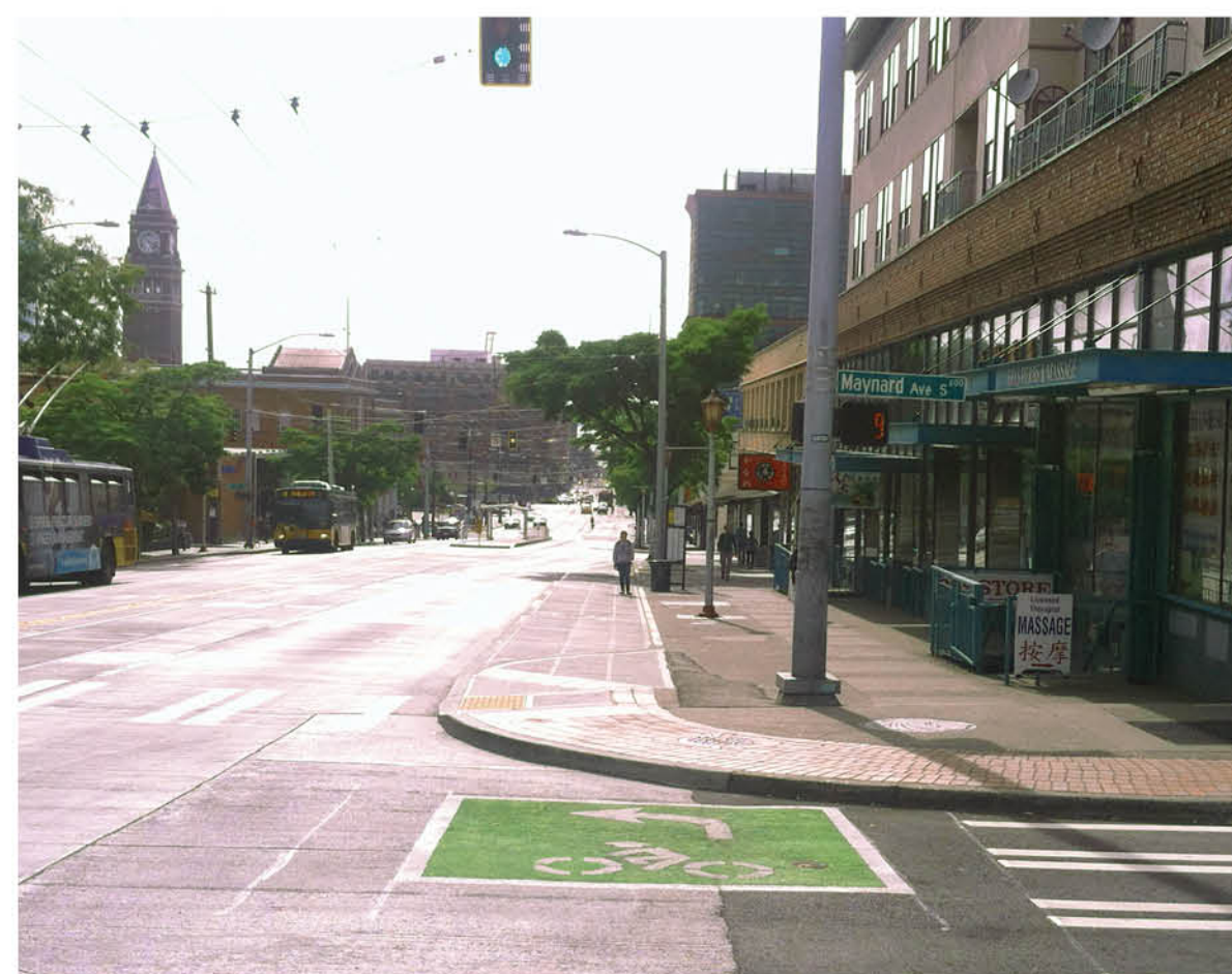
3 Left Turn Bike Box