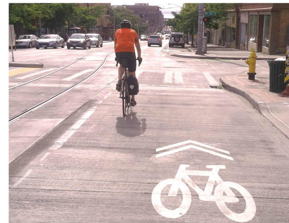
5 Sharrow